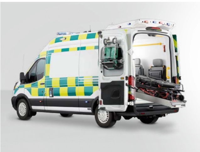
The WAS Multi-Load Assist move-in assistance is compatible with all standard roll-in stretchers.

The concept is transferable to other base vehicle types. The equipment is an example and can be customised.