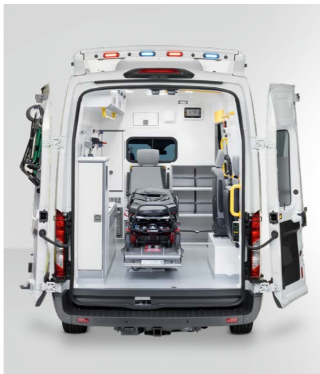
The attendant's seats are easily folded up to assure the optimal use of space and a maximum mobility.