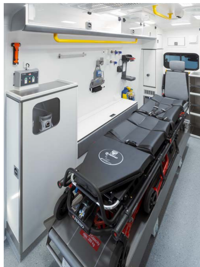
A light and friendly interior equipment offers high comfort to the patient.

engine. Continuous mobile data connectivity is guaranteed by standalone data transfer systems like 4G and Kymeta™ satellite systems. By having a Ford Transit chassis, with a powerful petrol engine and a GVW of 4300kg, this compact ambulance defines the future for both, paramedics and patients, in the present.