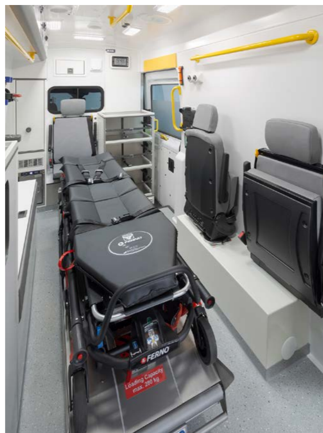
High efficiency LED lighting including blue trauma light.