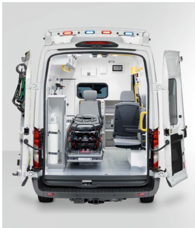
The patient stretcher can be easily moved into any position required.