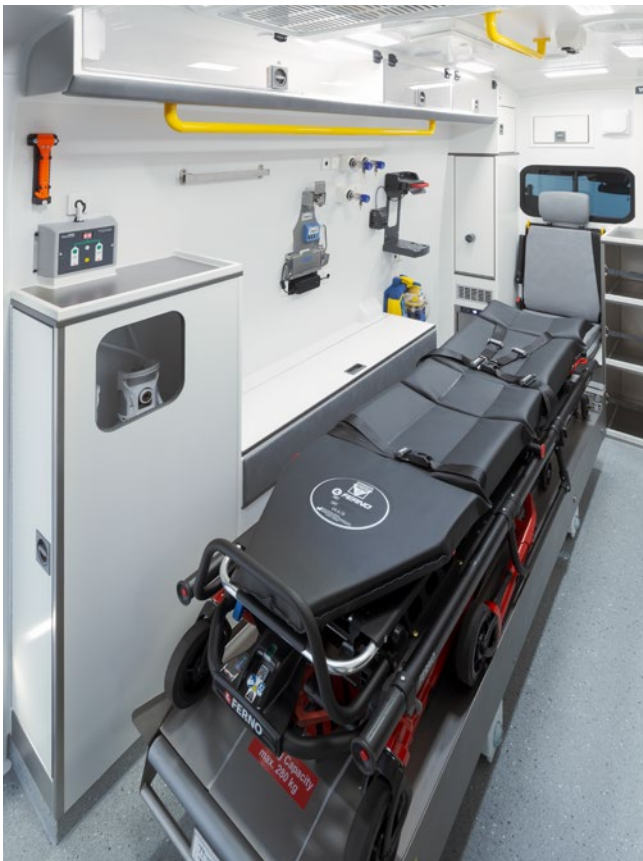
A light and friendly interior equipment offers high comfort to the patient.

engine. Continuous mobile data connectivity is guaranteed by standalone data transfer systems like 4G and Kymeta™ satellite systems. By having a Ford Transit chassis, with a powerful petrol engine and a GVW of 4300kg, this compact ambulance defines the future for both, paramedics and patients, in the present.