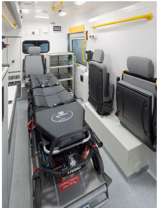
High efficiency LED lighting including blue trauma light.