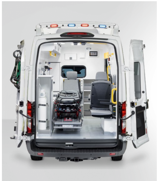
The patient stretcher can be easily moved into any position required.