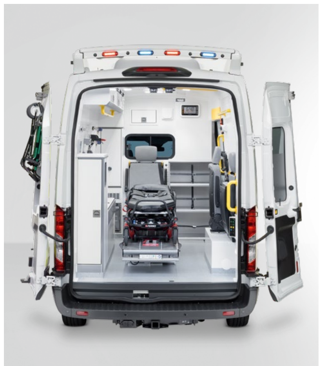
The attendant's seats are easily folded up to assure the optimal use of space and a maximum mobility.